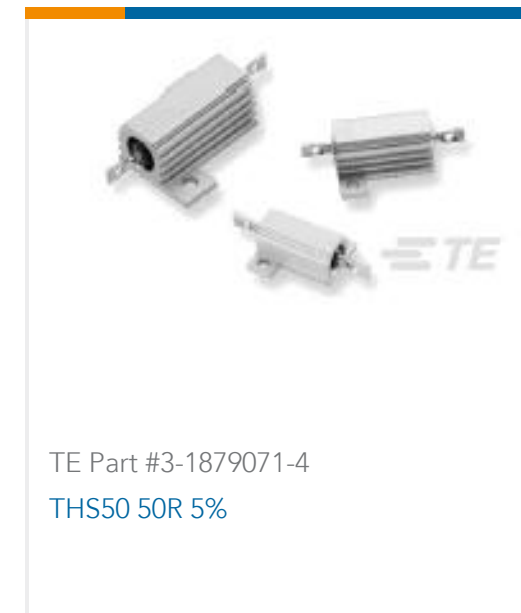
TE Part #3-1879071-4 THS50 50R 5%