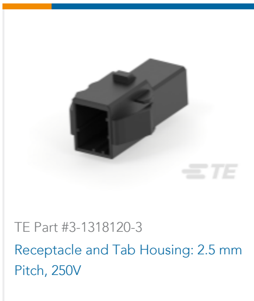
TE Part #3-1318120-3 Receptacle and Tab Housing: 2.5 mm Pitch, 250V