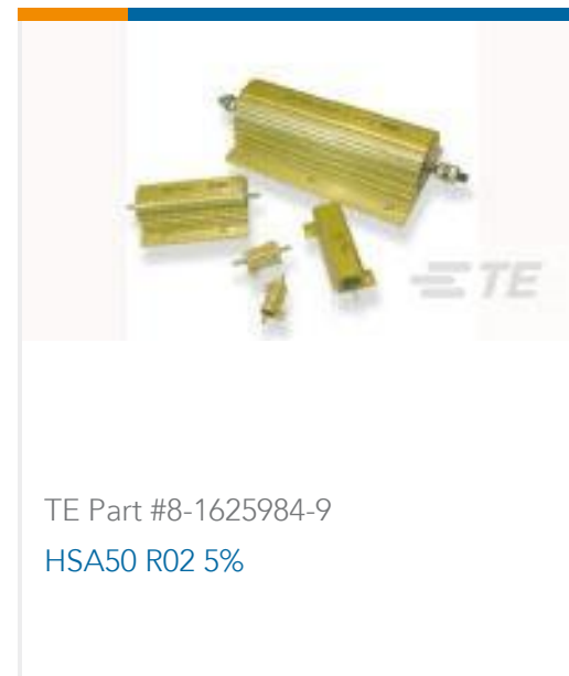
TE Part #8-1625984-9 HSA50 R02 5%