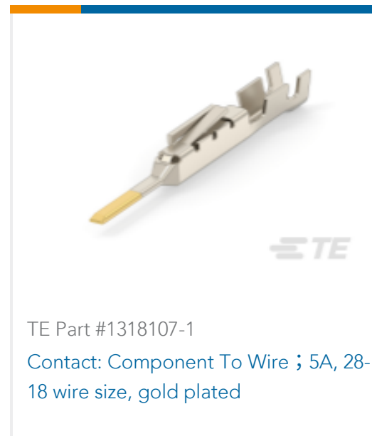
TE Part #1318107-1 Contact: Component To Wire ; 5A, 28-18 wire size, gold plated