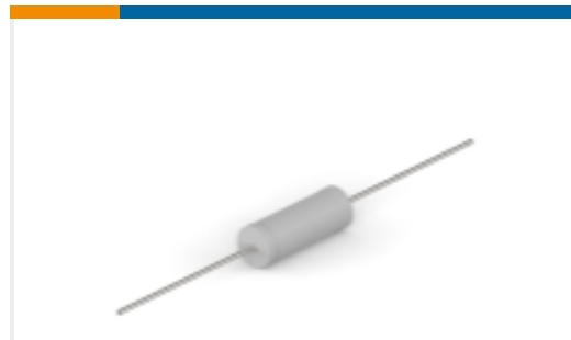
TE Part #8-2176412-4 5W XSM M/OX 5% 15K