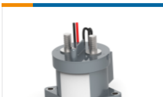
TE Part #2071410-1 IHV200AAANA