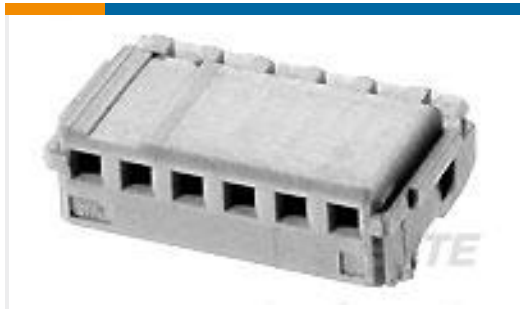
TE Part #1-353908-6 CT REC HSG 16P CRIMP TYPE WHIT