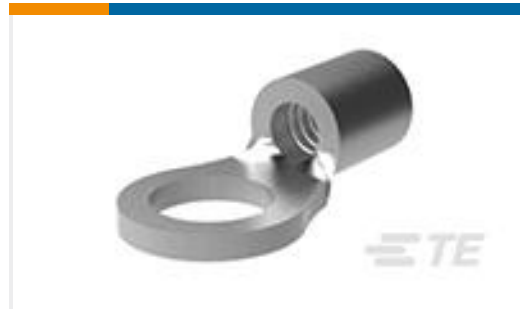
TE Part #322454 TERMINAL,SOLIS R 12-10 8