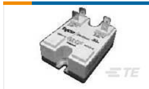
TE Part #1-1393030-4 SSRD-240D25 = PANEL MOUNT,25A, 240VAC