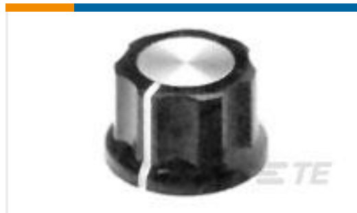
TE Part #5-1437624-3 PKES90B1/4=KNOB PLSTC FLUTED W