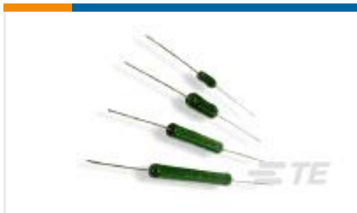
TE Part #1623773-8 C10 10K 5% (LOOSE)