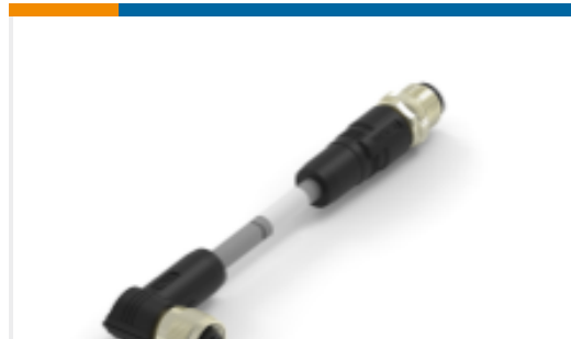
TE Part #TAA756A1611-020 M12A5-MS-FR-PVC-2.0M