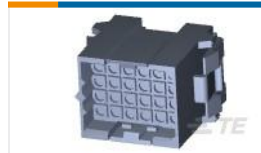
TE Part #207305-1 24 POS SQ GRID METRIMATE-RCPT