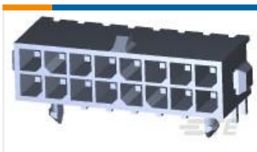
TE Part #4-794620-6 16P MICRO MNL ASSY,R/A,HDR,LF