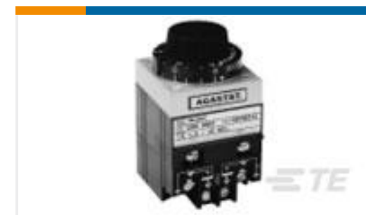
TE Part #1423157-5 7012AC=RLY,STD,ON,2P,120VAC,15