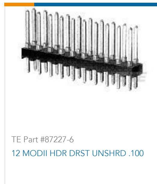
TE Part #87227-6 12 MODII HDR DRST UNSHRD .100