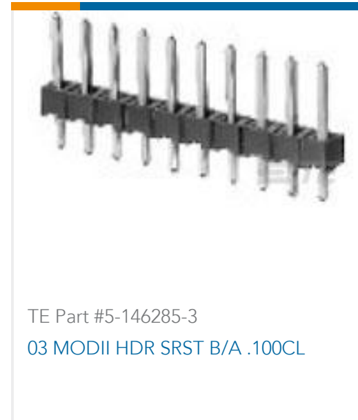
TE Part #5-146285-3 03 MODII HDR SRST B/A .100CL