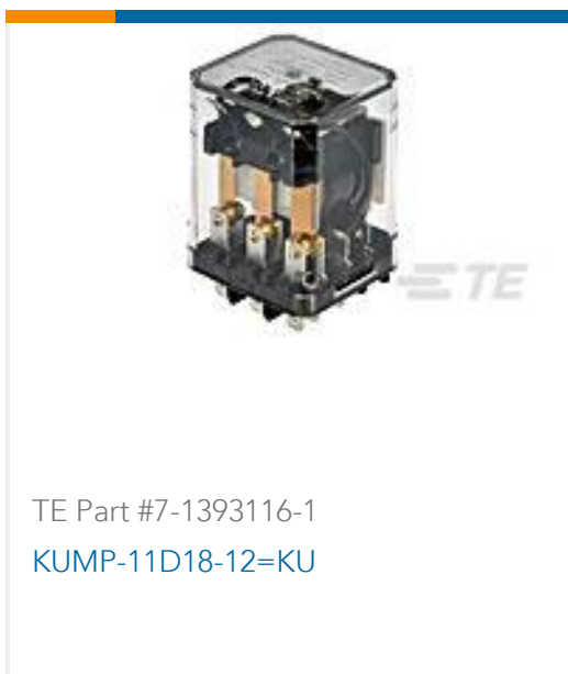
TE Part #7-1393116-1 KUMP-11D18-12=KU