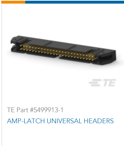
TE Part #5499913-1 AMP-LATCH UNIVERSAL HEADERS