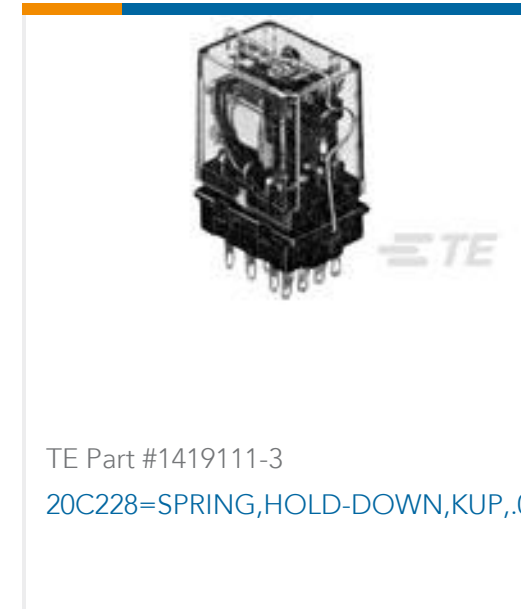
TE Part #1419111-3 20C228=SPRING,HOLD-DOWN,KUP,.0