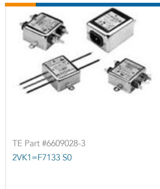
TE Part #6609028-3 2VK1=F7133 S0