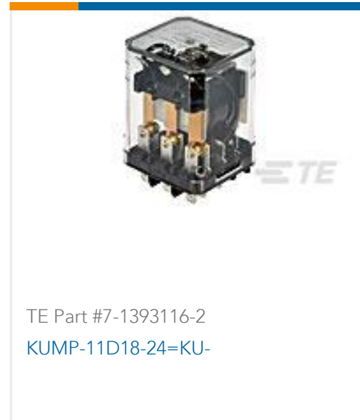
TE Part #7-1393116-2 KUMP-11D18-24=KU-