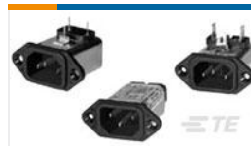
TE Part #6609000-4 3EEA1=F7115 S0