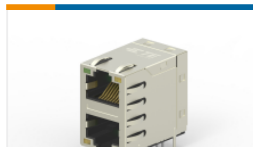
TE Part #2301997-5 RJ45 JACK INT.MAG. 10/100 LED 2X1