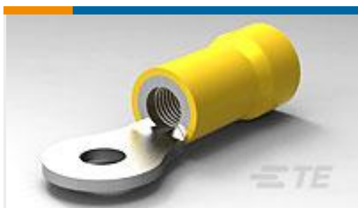
TE Part #34853 TERMINAL, PG R 12-10 8