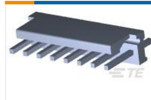
TE Part #644752-8 08P MTA156 HDR ASSY SQ STR F/L