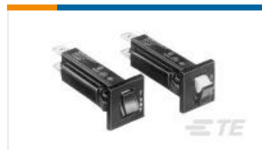
TE Part #2-1393250-3 W28-XQ1A-1=W28-