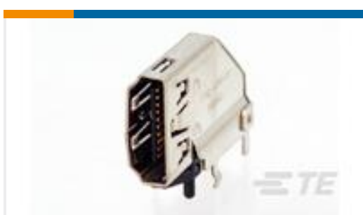
TE Part #2007435-3 Std HDMI, Flag, T/H