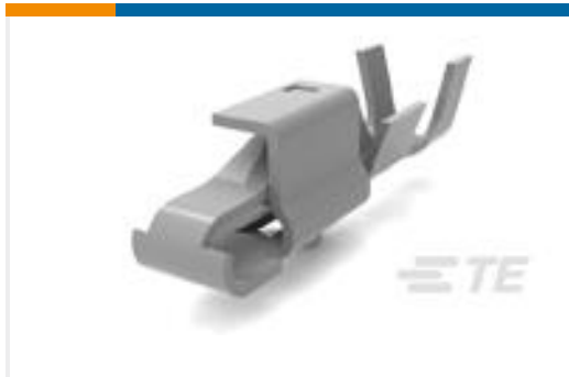
TE Part #3-770522-1 SL156 HOODED CONTACT, LP LF