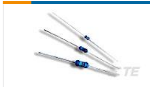
TE Part #1622349-1 LR1 1% 1K0