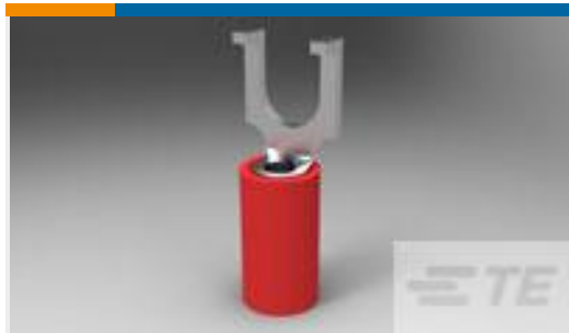
TE Part #1-331366-1 PIDG SPDFLG 22-16COM22-18MIL10