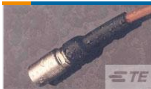
TE Part #9531152005 CGAT-9/3-0-STK