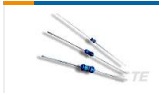
TE Part #1622321-1 LR1 1% 150R