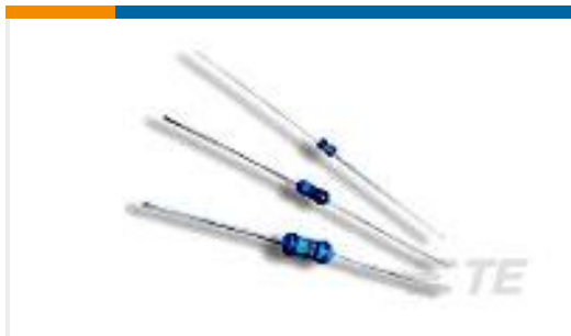
TE Part #1622486-1 LR1 1% 470R