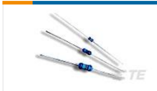
TE Part #1622297-1 LR1 1% 100R