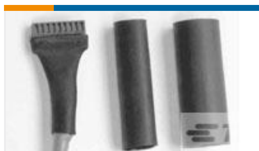
TE Part #7580142002 DWP-125-3/8-0-STK