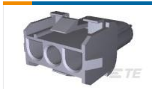
TE Part #1-480701-2 03P UMNL CAP HSG RED