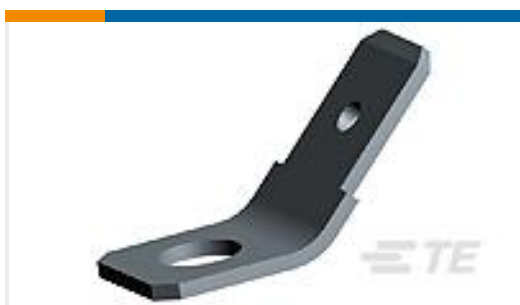
TE Part #181949-2 250 FASTON, TAB, TPBR