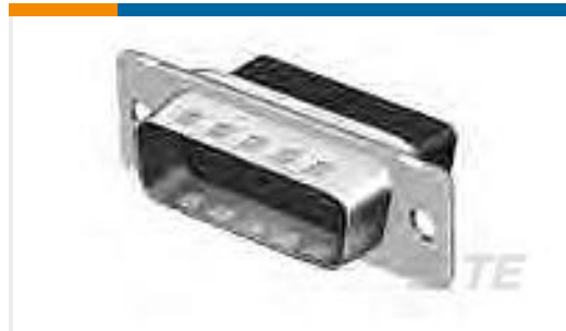
TE Part #167294-1 25P HDP20 PLUG ASSY