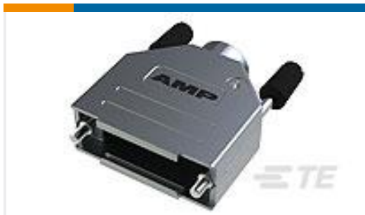
TE Part #2-1478762-5 METAL BACKSHELL 25 WAY TOP E