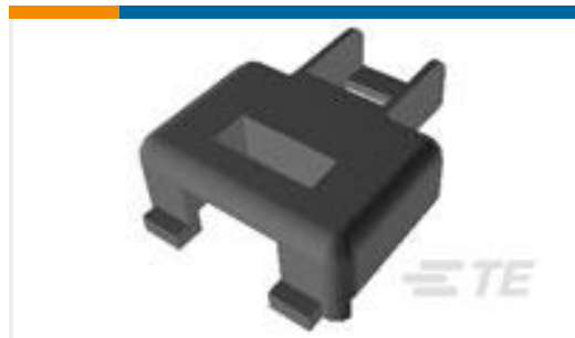
TE Part #641777-1 UMNL STR/REL ADAPTER NATL