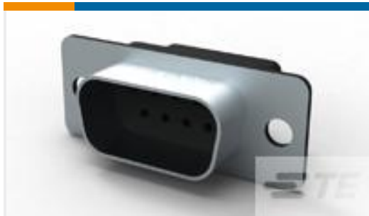
TE Part #205204-8 HDP-20, PLUG, SIZE 1, 9 POSN