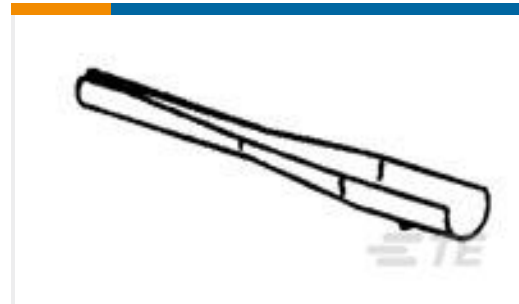
TE Part #543382-8 INSERT/EXTRACT TIP 25-KIT