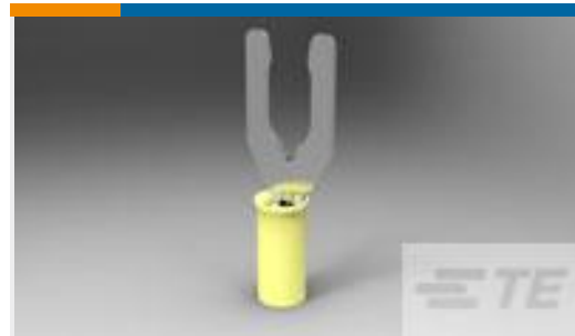
TE Part #52432-1 TERMINAL, PIDG SPR SPD 12-10 10