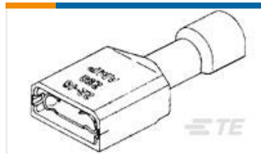
TE Part #2-520401-2 ULTRA-FAST 187 ASY REC 22-18 TPBR