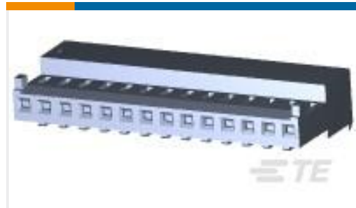
TE Part #4-643813-4 14P MTA100 CONN ASSY POL RIB