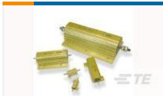
TE Part #3-1625985-4 NHSA50 25R 5%