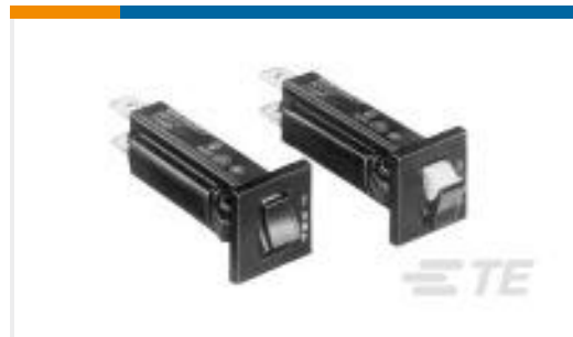
TE Part #1-1393250-9 W28-XQ1A-0.25=W28