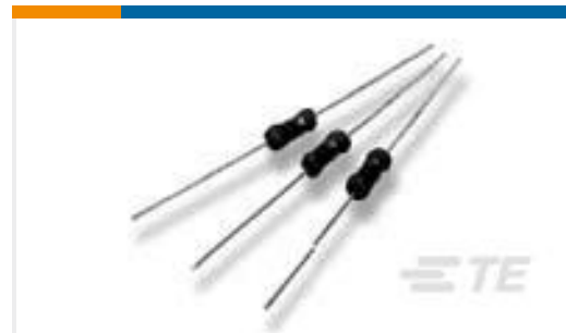
TE Part #5-1625890-0 2W SM M/OX 5% 470K