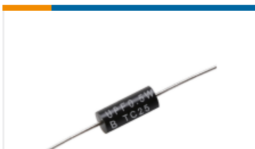
TE Part #2176163-1 UPF50 0.1% 5PPM 100K