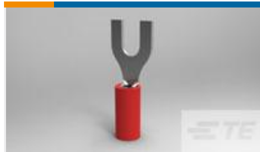
TE Part #32053 PIDG SPD 22-16 COMM 22-18MIL 8