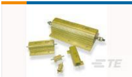
TE Part #1625999-7 HSC100 16R6 5%