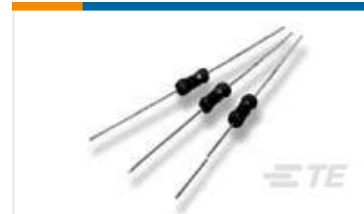
TE Part #1-1625886-8 1W SM M/OX 5% 470R