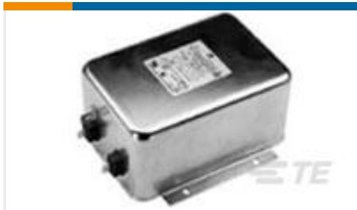
TE Part #6609046-1 3ET1 M0=F7002