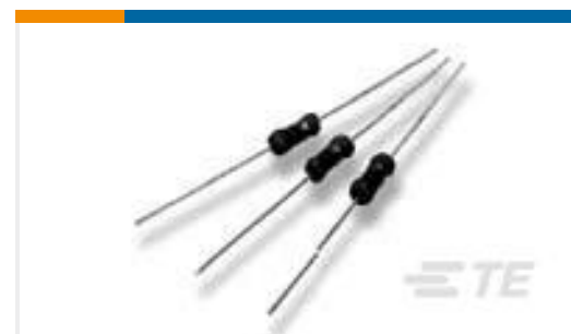
TE Part #3-1625892-2 3W SM M/OX 5% 22K