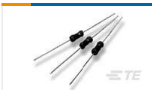
TE Part #2-1625886-2 1W SM M/OX 5% 4R7