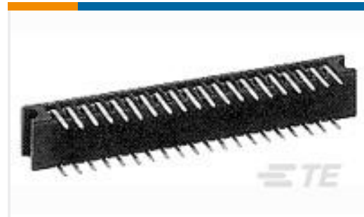
TE Part #532956-1 12 MODII 2PC CE RCPT ASSY