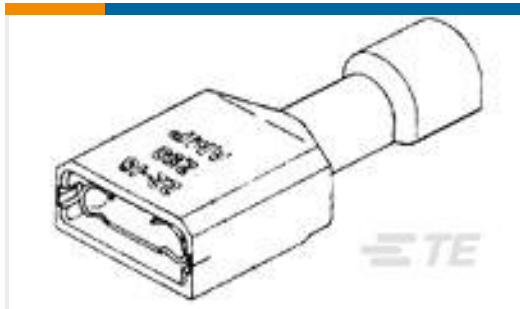
TE Part #3-350820-2 ULTRAFAST 250 ASSY REC 16-14 TPBR LP