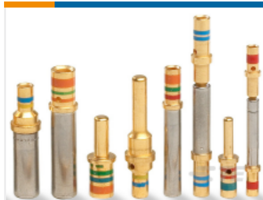
TE Part #0641-3-1231L CONT PIN