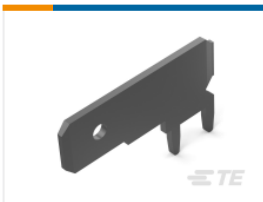
TE Part #63951-4 250 FASTON TAB TPBR