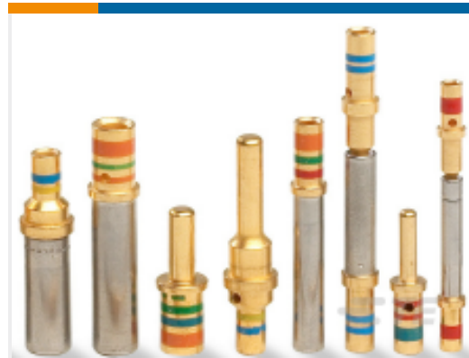
TE Part #0660-206-1282 CONT PIN