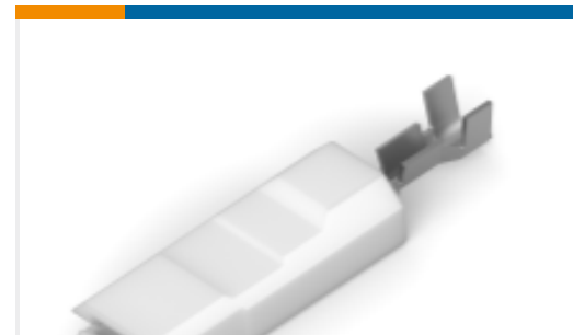
TE Part #520974-2 ULTRA POD: Straight, Receptacle Assembly, Tin Plated, 0.25 inch