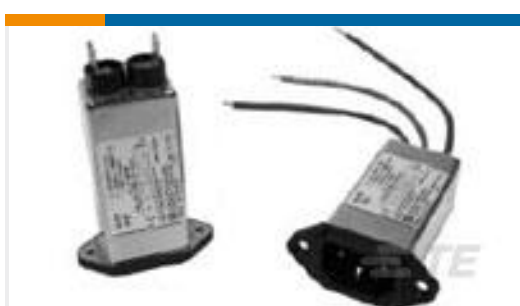
TE Part #2-6609006-4 10EJT1=F8136