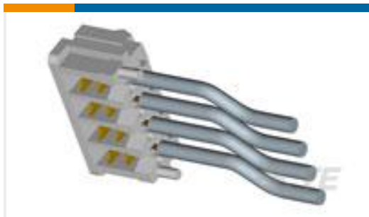
TE Part #2-173977-4 CT CONN MT REC ASSY 4P BLUE