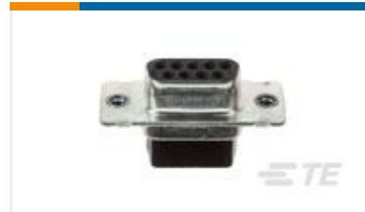
TE Part #1658643-1 HDP-20,RCPT,SIZE 1, 9 POSN,CLI