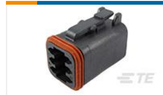
TE Part #DT06-6S-E004 PLG, 6P, BLK, N