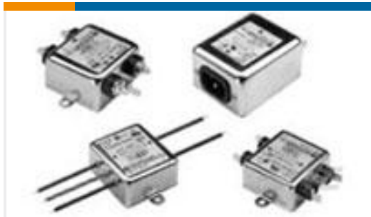
TE Part #2-6609028-3 40VK6=F7864 S0