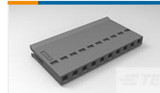
TE Part #487378-4 005 HOUSING FFC RCPT 100CL SR