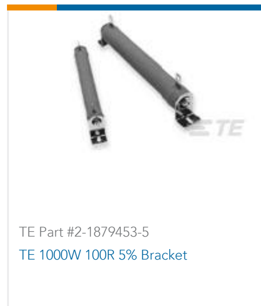
TE Part #2-1879453-5 TE 1000W 100R 5% Bracket