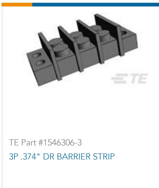
TE Part #1546306-3 3P .374" DR BARRIER STRIP