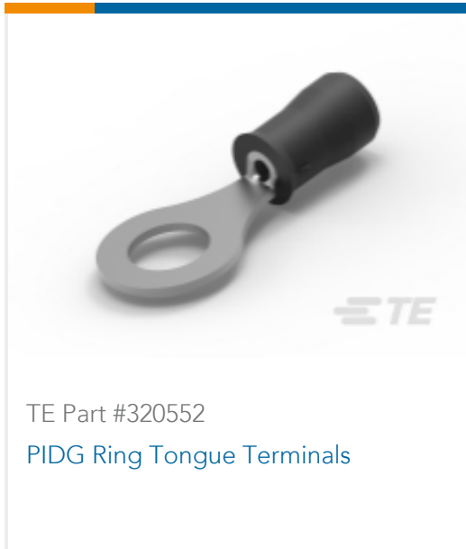
TE Part #320552 PIDG Ring Tongue Terminals