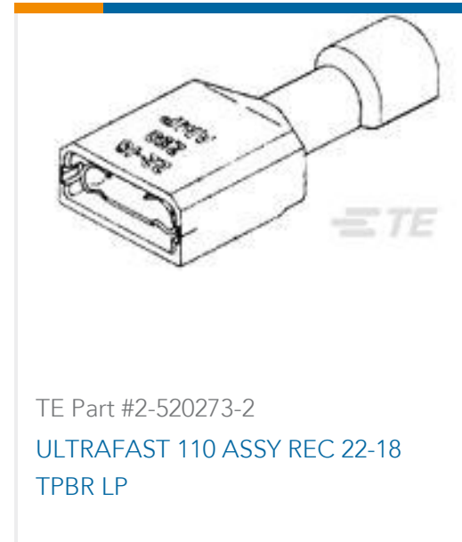
TE Part #2-520273-2 ULTRAFAST 110 ASSY REC 22-18 TPBR LP