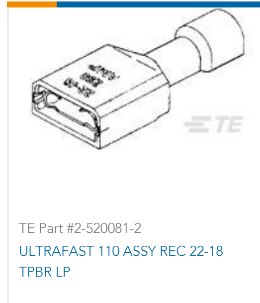
TE Part #2-520081-2 ULTRAFAST 110 ASSY REC 22-18 TPBR LP