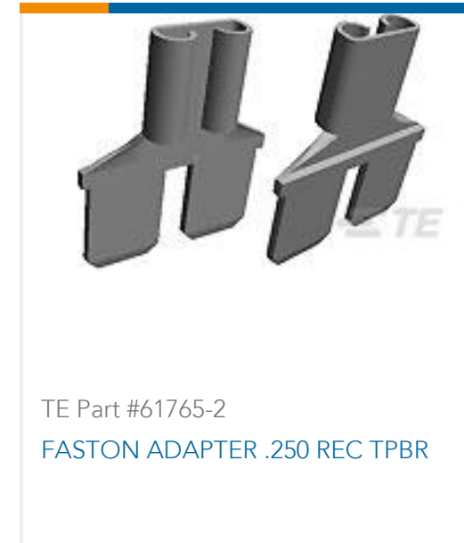
TE Part #61765-2 FASTON ADAPTER .250 REC TPBR