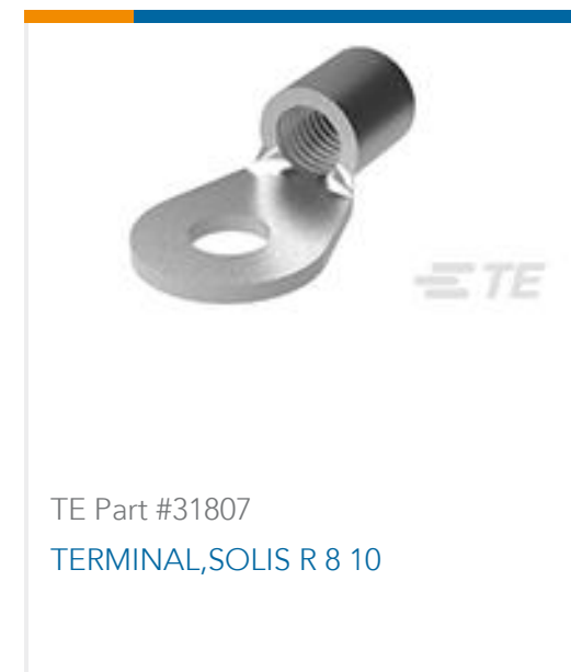
TE Part #31807 TERMINAL,SOLIS R 8 10