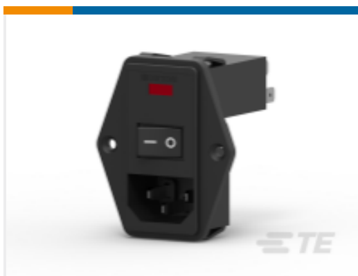
TE Part #9-6609955-2 PE0S0D000=C4906