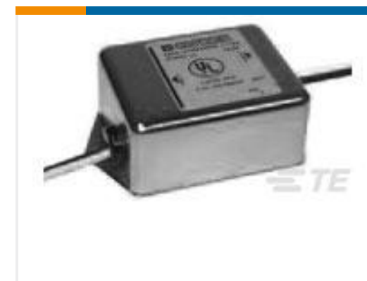
TE Part #2-6609092-3 3FL3=F5198