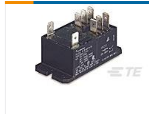
TE Part #4-1393211-6 T92P11A22-277