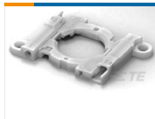
TE Part #2174024-1 LUMAWISE LED HOLDER, TYPE NL2