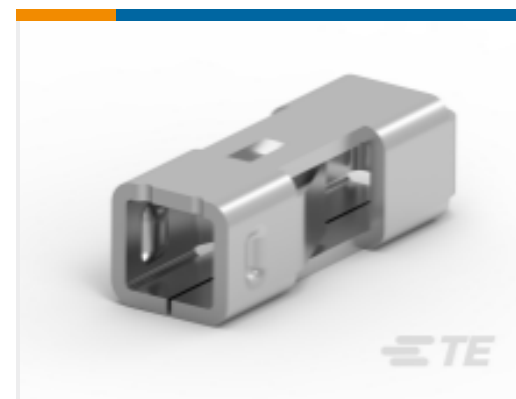
TE Part #2834171-3 ULTRAMINIATURE SLIM CONTACT