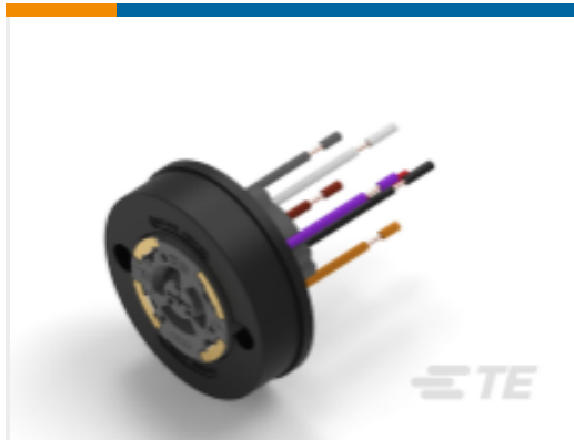
TE Part #2213627-2 ASSEMBLY, ROT DIM REC 49.22MM 7 POS 150C