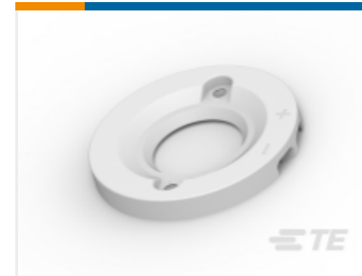
TE Part #2213580-2 Z50 Zhaga Profile LED Holders