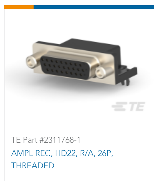
TE Part #2311768-1 AMPL REC, HD22, R/A, 26P, THREADED