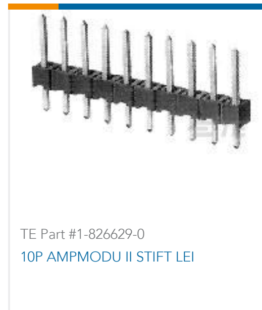
TE Part #1-826629-0 10P AMPMODU II STIFT LEI