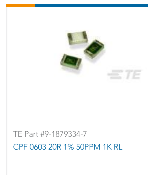
TE Part #9-1879334-7 CPF 0603 20R 1% 50PPM 1K RL