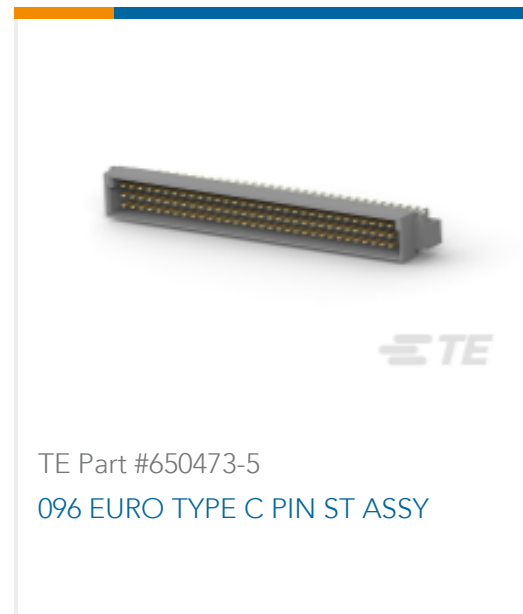
TE Part #650473-5 096 EURO TYPE C PIN ST ASSY