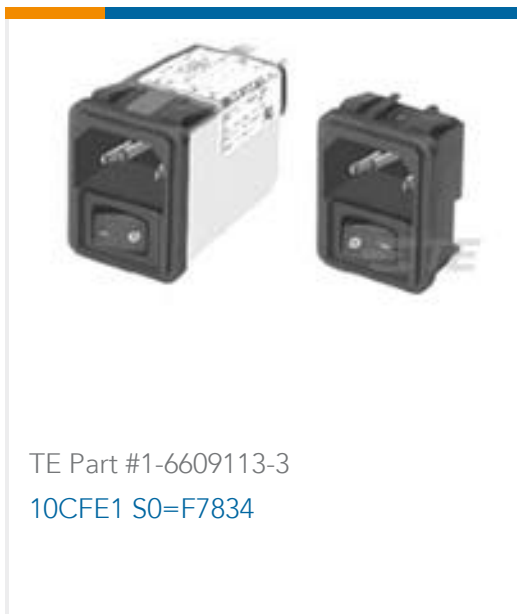
TE Part #1-6609113-3 10CFE1 S0=F7834