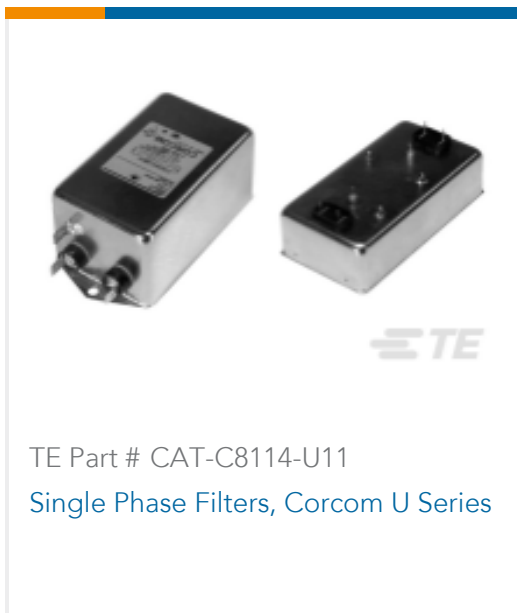
TE Part # CAT-C8114-U11 Single Phase Filters, Corcom U Series