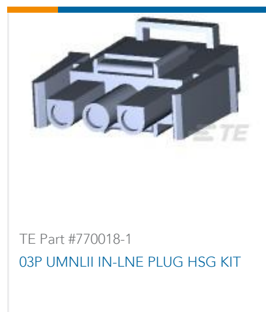
TE Part #770018-1 03P UMNLI IN-LNE PLUG HSG KIT