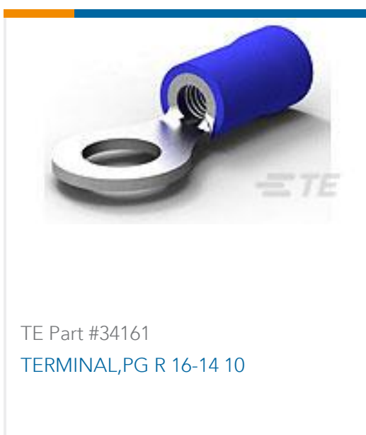
TE Part #34161 TERMINAL,PG R 16-14 10