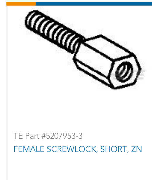
TE Part #5207953-3 FEMALE SCREWLOCK, SHORT, ZN