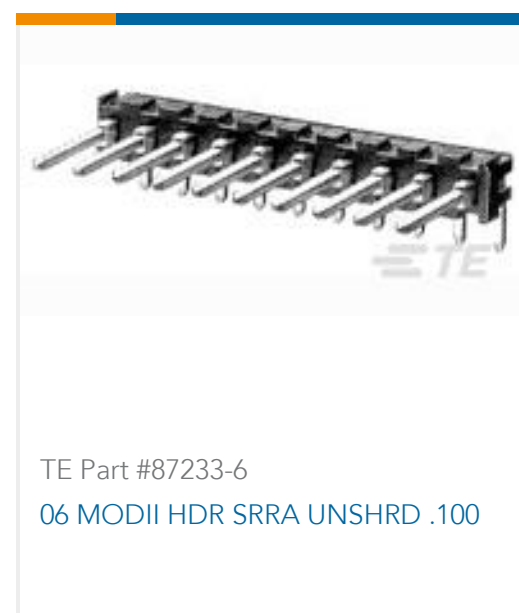
TE Part #87233-6 06 MODII HDR SRRA UNSHRD .100