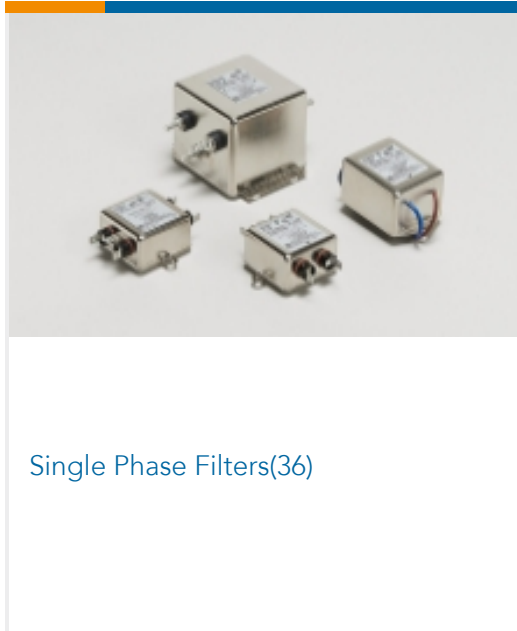
Single Phase Filters(36)