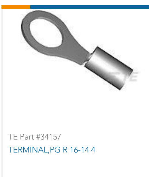
TE Part #34157 TERMINAL,PG R 16-14 4