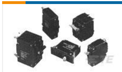
TE Part #7-1393254-4 W92-X112-25=M6/M7/M9/W6/W7