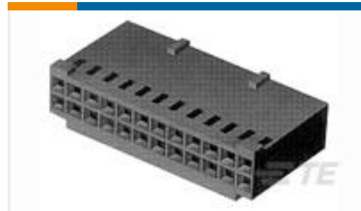
TE Part #3-87977-5 20 MODIV HSG COMP DR .100 POL