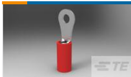
TE Part #320553 PIDG R 22-16 COMM 22-18 MIL 4