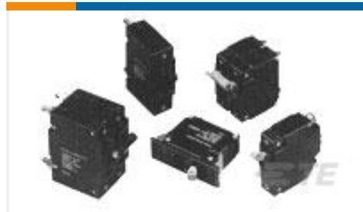
TE Part #6-1393254-8 W92-X112-10=M6/M7/M9/W6/W7