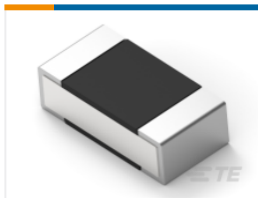
TE Part #2-2176307-9 RP 1E 0.1W 24K3 0.1% 25PPM 5K RL