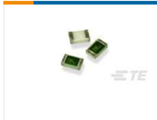
TE Part #7-1879061-4 CPF 0402 10K 0.1% 25PPM 5K RL