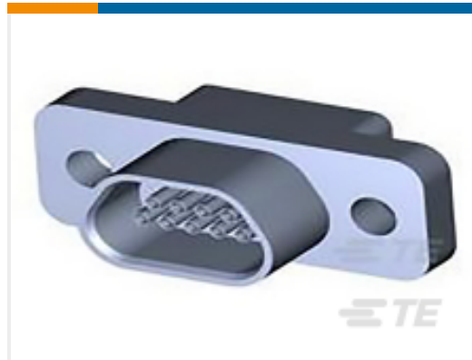
TE Part #1532209-1 M83513/01-AN, MCKS-N1-B-9PS