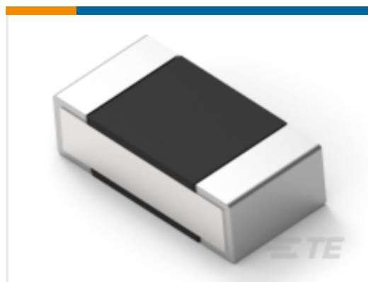
TE Part #2176308-9 RP 1E 0.1W 162K 0.1% 25PPM 5K RL