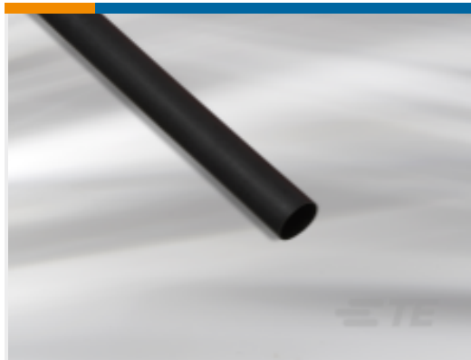
TE Part #NB07092001 BATTU Heat Shrink Tubing