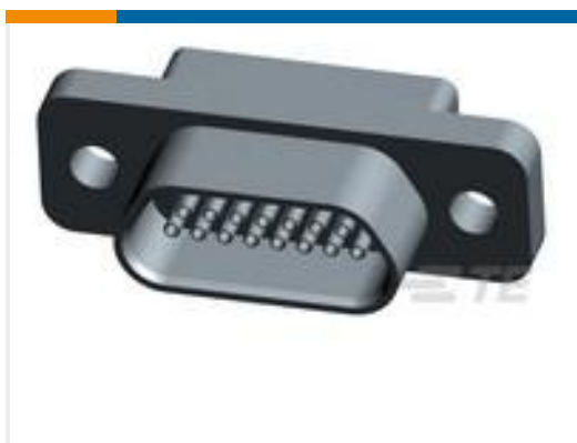
TE Part #1532188-1 M83513/02-BN, MCKS-N1-B-15SS