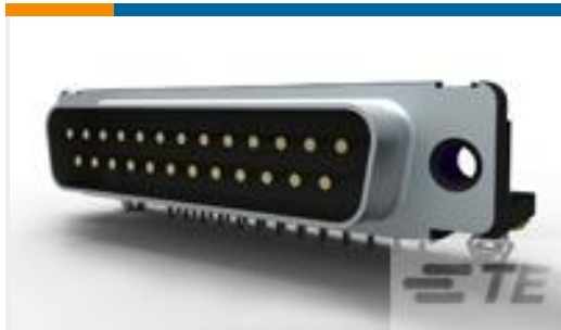
TE Part #5747842-4 25 MSFL PLUG RA 318 (IN,FM,BL)