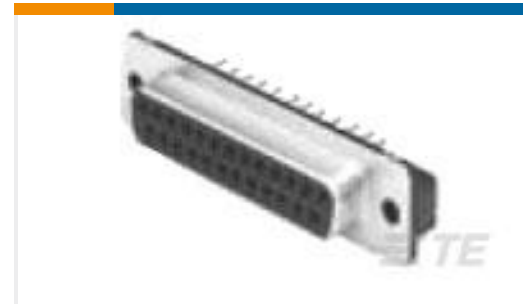
TE Part #5747150-2 09 RCPT SP/FMS STD