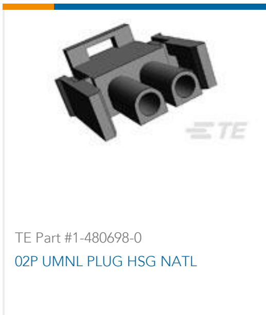
TE Part #1-480698-0 02P UMNL PLUG HSG NATL