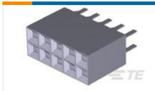
TE Part #534206-5 10 MODII VRT DR CE 100/115