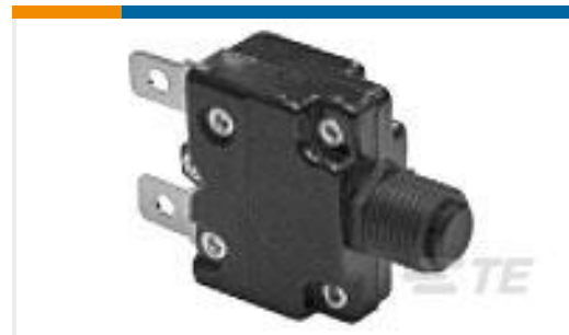
TE Part #2-1423675-3 W57-XB2A99C10-10=CKTBKR,THERM,