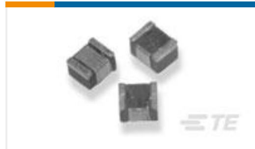
TE Part #1-1624110-2 3650 0805 LAB KIT