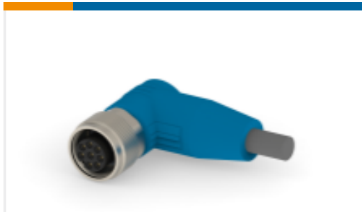
TE Part #T4161420008-003 RPC-M12-FR-8CON-PUR-1.5SH