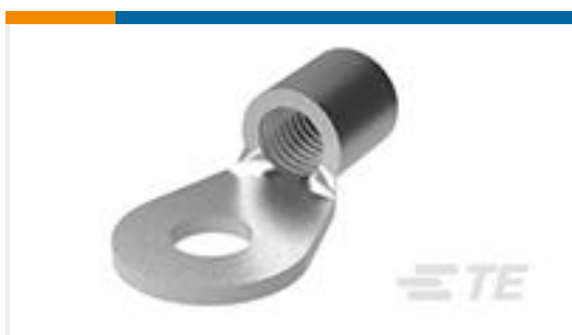
TE Part #33114 TERMINAL,SOLIS R 4 10