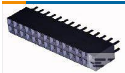
TE Part #6-534206-4 28 MODII VRT DR CE 100/115