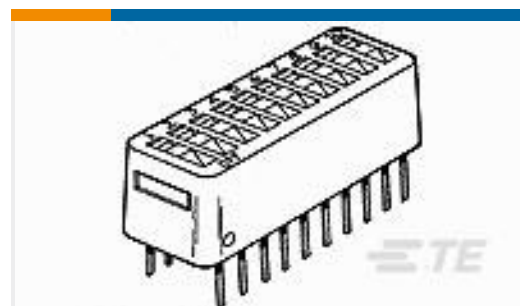
TE Part #3-435668-2 DIP SW 12 POSN W/TAPE AU