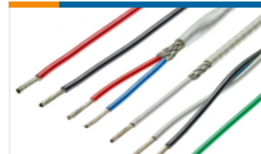
TE Part #081937-000 44AM1121-22-6/9-9CS2275