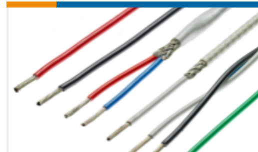
TE Part #957789-000 44A0121-24-9/96CS2275