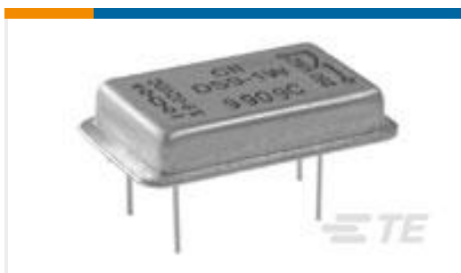
TE Part #1-1617069-0 DS9-1W=DS9 DIP SOLID STATE RELAY