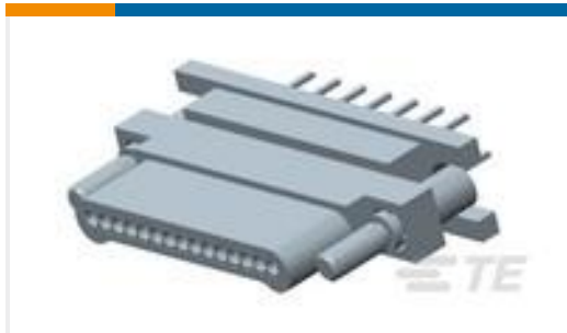
TE Part #1589461-7 SSM009C5N = Thru-Hole