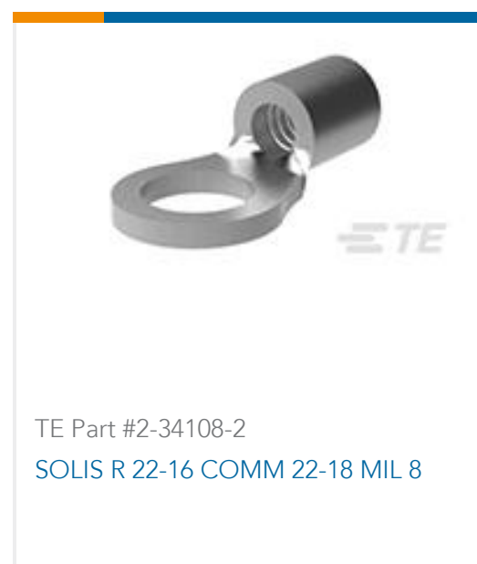
TE Part #2-34108-2 SOLIS R 22-16 COMM 22-18 MIL 8