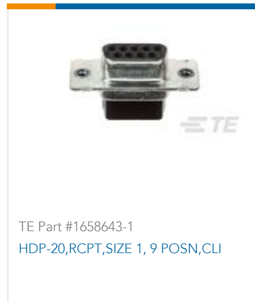
TE Part #1658643-1 HDP-20,RCPT,SIZE 1, 9 POSN,CLI