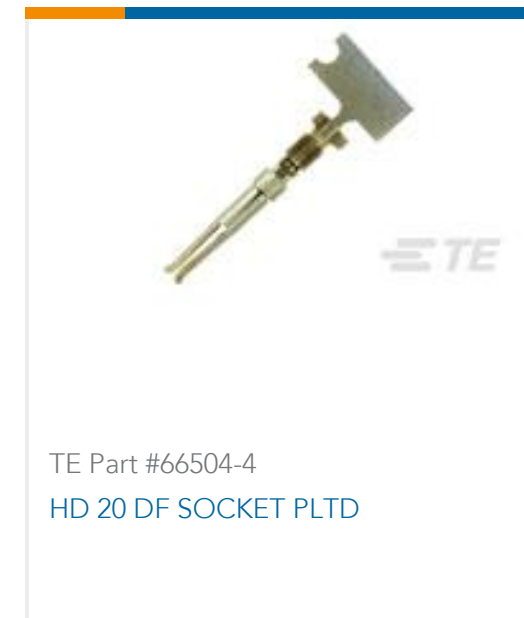
TE Part #66504-4 HD 20 DF SOCKET PLTD