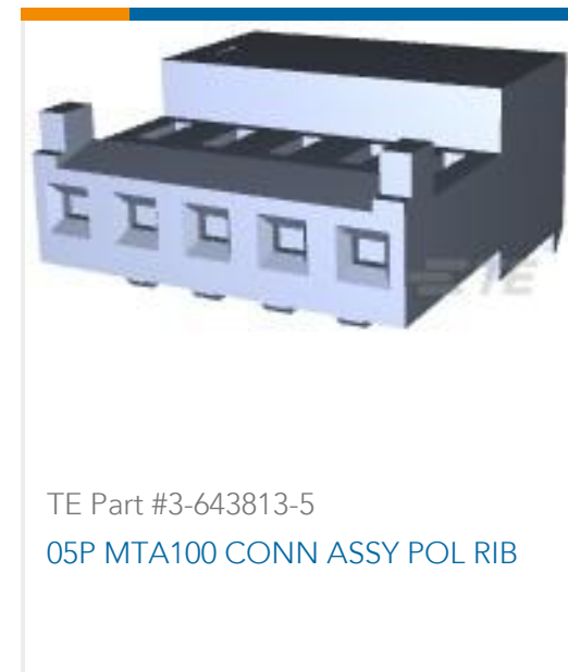
TE Part #3-643813-5 05P MTA100 CONN ASSY POL RIB