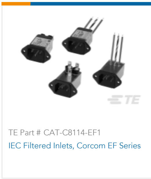
TE Part # CAT-C8114-EF1 IEC Filtered Inlets, Corcom EF Series