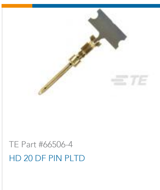
TE Part #66506-4 HD 20 DF PIN PLTD