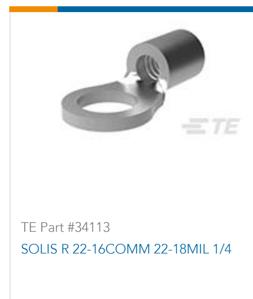
TE Part #34113 SOLIS R 22-16COMM 22-18MIL 1/4