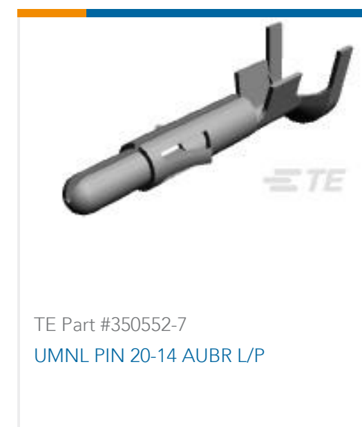
TE Part #350552-7 UMNL PIN 20-14 AUBR L/P