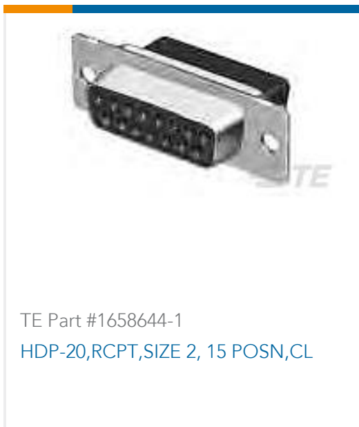
TE Part #1658644-1 HDP-20,RCPT,SIZE 2, 15 POSN,CL