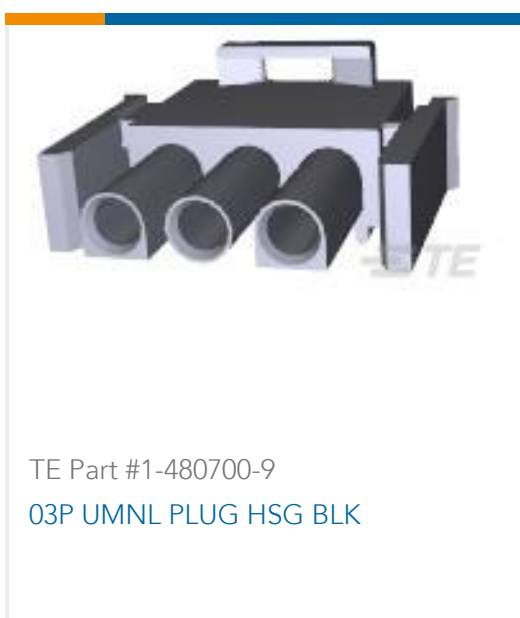
TE Part #1-480700-9 03P UMNL PLUG HSG BLK