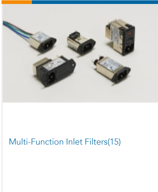
Multi-Function Inlet Filters(15)