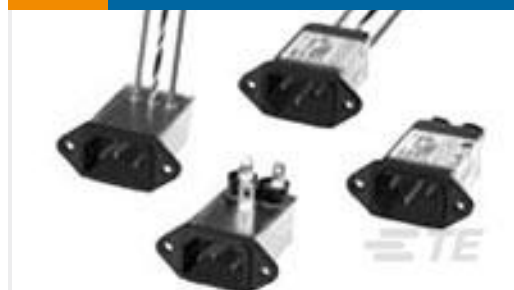
TE Part #6609015-9 15EF1F=F7701 S0