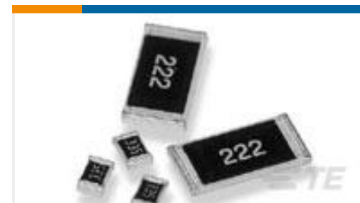
TE Part #1622829-1 CRG0603 1% 10K