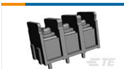
TE Part #1977477-3 Module Dual Barrier, .325 CL, 3 Pos.