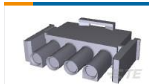
TE Part #350779-1 04P UMNL PLUG HSG