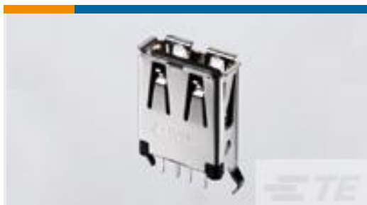
TE Part #1734366-1 Std USB Type A, VT, T/H