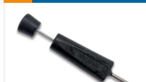
TE Part #2063388-1 TOOL, EXTRACTION