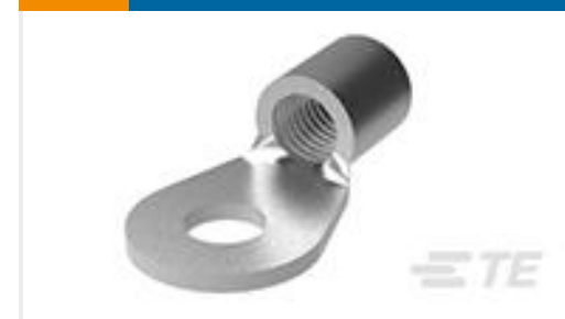
TE Part #52197 TERMINAL, SOLIS R 6 10