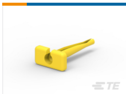
TE Part #114010-ZZ EXT TOOL, SIZE 12, 12 AWG, N, YEL