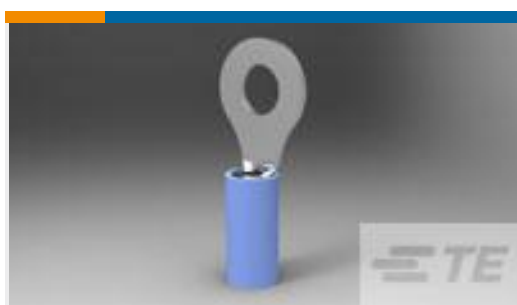
TE Part #320563 TERMINAL,PIDG R 16-14 1/4