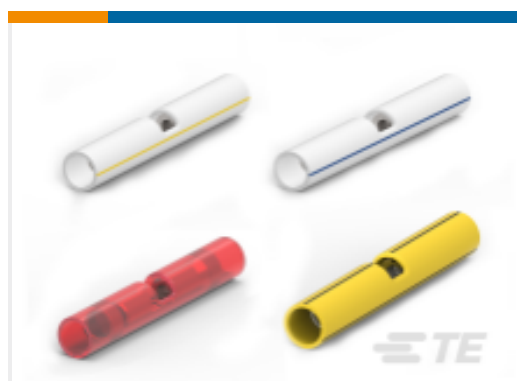
TE Part #320562 PIDG Butt Splices