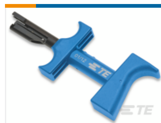
TE Part # 654632-1 SERVICE TOOL MAXI TERMI POINT