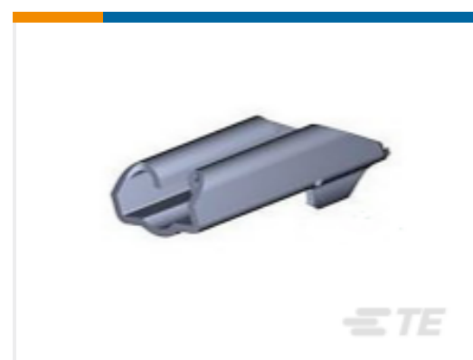
TE Part # 2-330854-5 MAXI T.P. CLIP