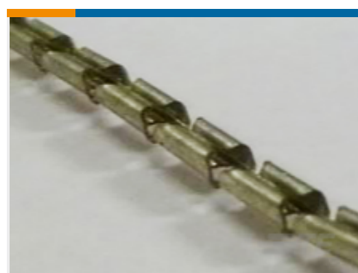
TE Part # 2-330854-6 MAXI T.P. CLIP