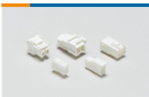
Rectangular Power Connectors(111)