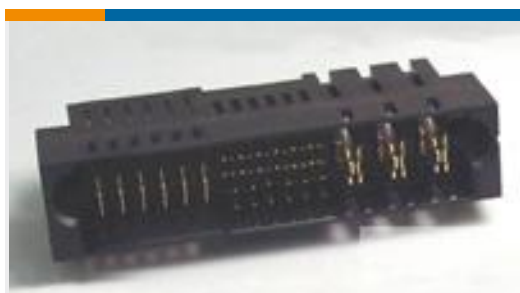
TE Part # 6450840-7 MBXLE R/A HEADER 1P+24S+1P