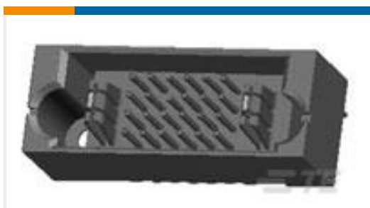
TE Part # 6450820-2 MBXLE VERT HDR 1P+24S+1P