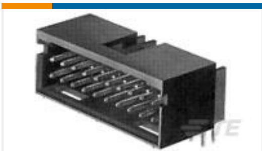
TE Part #6-103166-0 24 MODII HDR DRRR SHRD LF