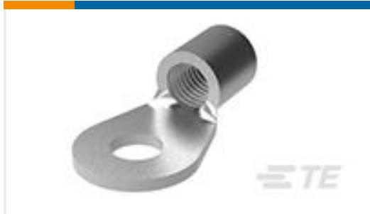
TE Part #322224 TERMINAL,SOLIS R 2/0 5/8