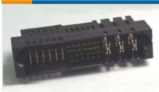
TE Part #6450843-6 MBXLE R/A HEADER 7ACP