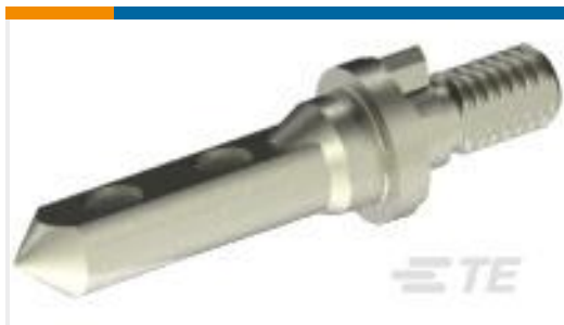
TE Part #1-1469491-2 MULTIGIG RT GUIDEPIN, 9MM 2.60