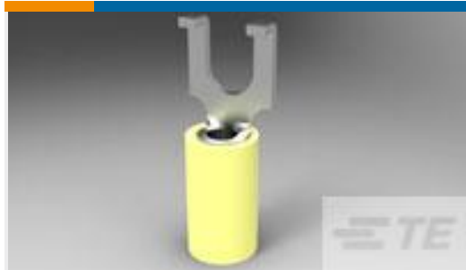
TE Part #324587 TERMINAL,PIDG SPD FLG 12-10 6