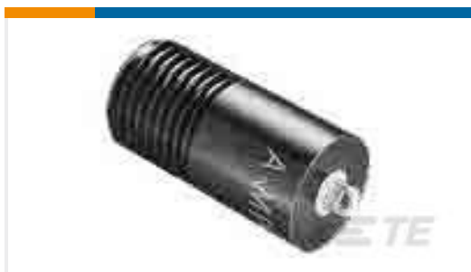
TE Part #830178-1 RECEPTACLE