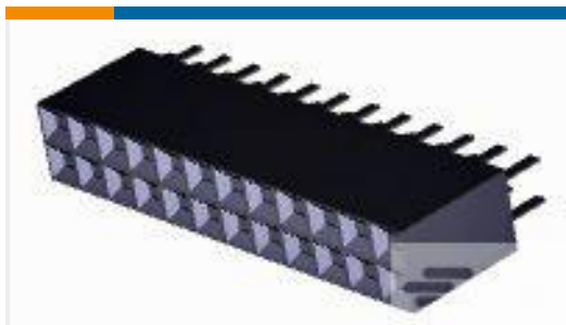
TE Part #1-534998-2 24 MODIV VRT DR CE 100/125