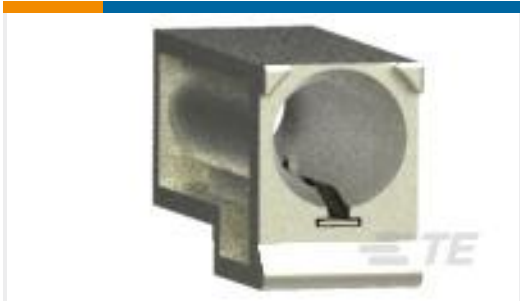
TE Part #1-1469492-9 MULTIGIG RT 9MM GUIDE/ESD UNKE