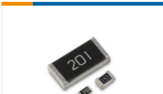
TE Part #4-2176329-9 CRGP 1210 100K 1%