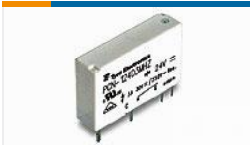
TE Part #3-1461491-6 PCN-124D3MHZ,000