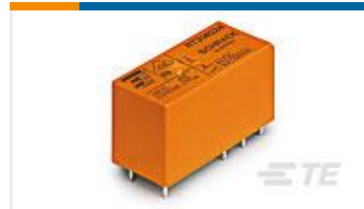
TE Part #6-1393238-2 RTD14012