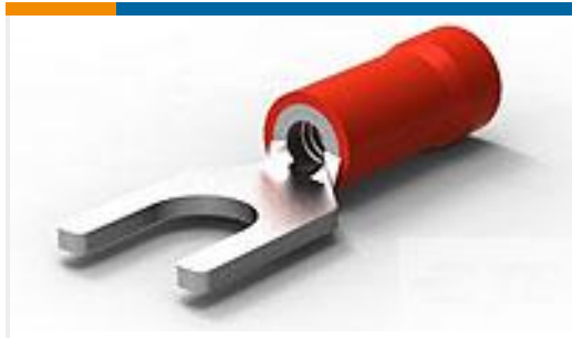
TE Part #165008 PLASTI-GRIP, SPADE 22-16 8