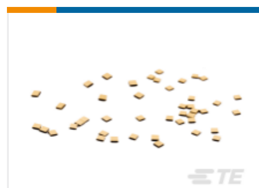
TE Part #GA10K3CG582 CHPG-10K +/- 1% B 3976 +/- 2% BT3Lo-D