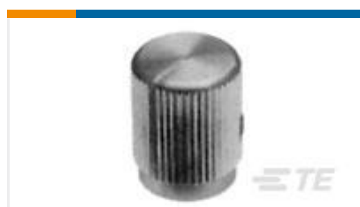
TE Part #9-1437621-7 KLN500A1/8=KNOB KNURL W/IND LI