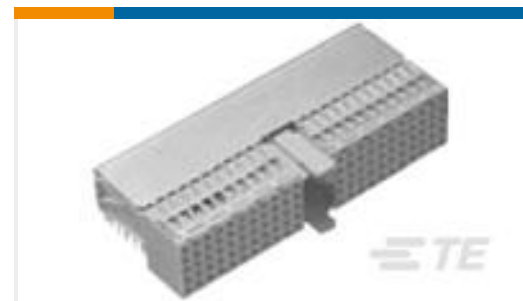
TE Part #5352068-9 Z-PACK/A RAF 110P