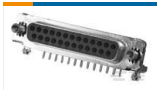
TE Part #5747844-5 09 MSFL RCPT RA 318 (SL,FM,BL)