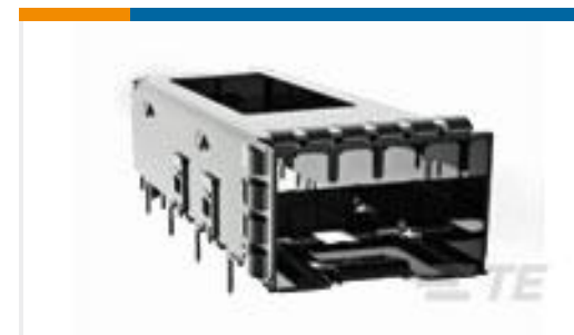
TE Part #2007198-2 SFP+ 1x1 Cage Assembly, Press-Fit