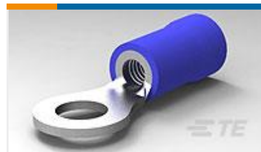
TE Part #328527 TERMINAL,PG R 16-14 8