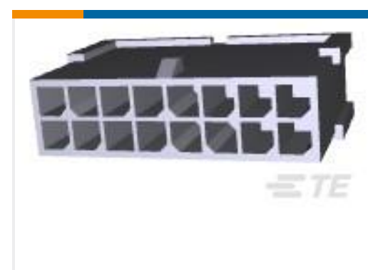
TE Part #1-794616-6 FREE HANG DBL ROW HSG 16 POS