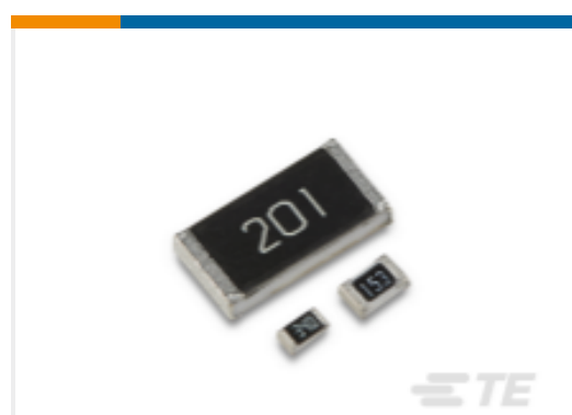
TE Part #2-2176329-5 CRGP 1210 1K0 1%