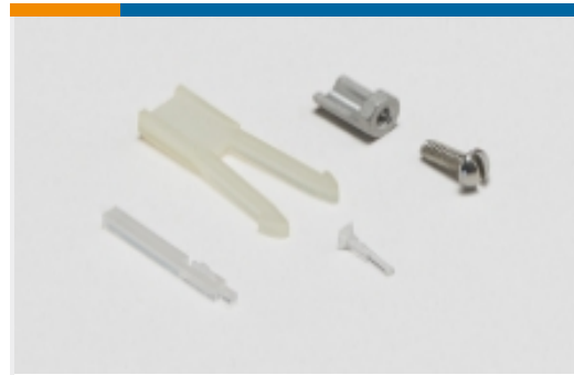
PCB Connector Keying(1)