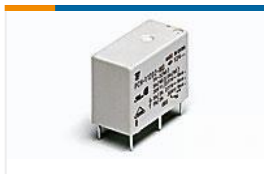
TE Part #1461353-5 PCH-112L2MH,000