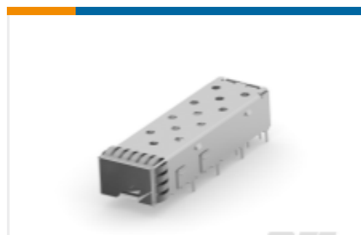
TE Part #2294667-5 SFP+ 1X1 CAGE ASSEMBLY, SOLDER TAIL