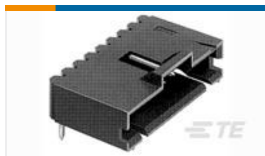
TE Part #5-104935-7 06 MTE HDR SRRA LTCH.100CL LF