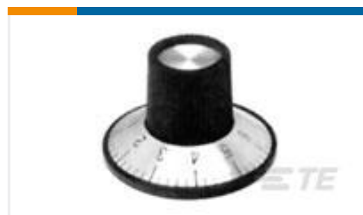
TE Part #9-1437624-9 PKS1132B101/4=SKIRT 0-10 PKS-1