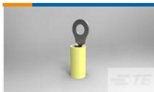
TE Part #54312-1 TERMINAL,PIDG R 26-24 10