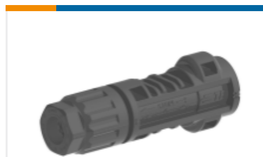
TE Part #2-2270024-1 SOLARLOK PV4-S DC Crimp Connectors