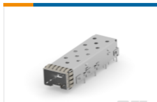
TE Part #2316664-1 SFP+ 1x1 Cage Assembly, PCI, Solder Tail