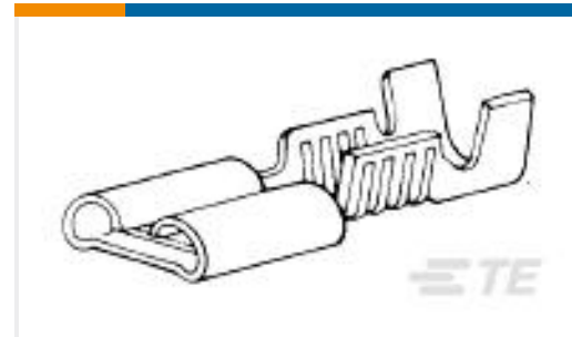
TE Part #60214-1 187 FASTON REC 20-16 AWG BR