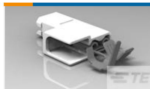
TE Part #521599-2 ULTRA-POD 187 ASY REC 18-14 TPBR