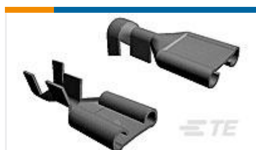
TE Part #60650-1 250 FASTON FLAG REC 18-14 AWG BR