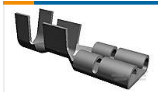
TE Part #63609-2 250 FASTON REC 22-18 AWG TPBR