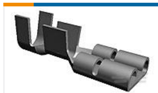
TE Part #63306-1 250 FASTON REC 18-14 AWG BR