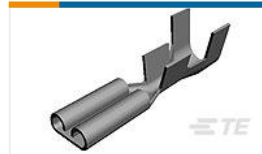
TE Part #41728 250 FASTON REC 16-12 AWG TPBR