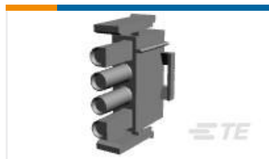
TE Part #1-480702-0 04P UMNL PLUG HSG NATL