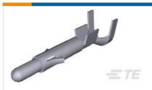
TE Part #350538-1 UMNL PIN 20-14 .0126 PTPBR