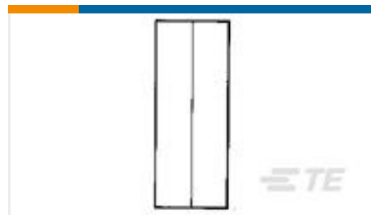
TE Part #36909 SPLICE,SOLIS PARA 3/0