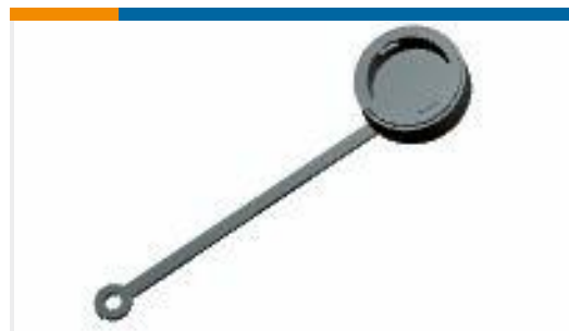
TE Part #206903-2 SEALING CAP ASSY,SZ 11,CPC