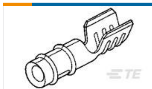
TE Part #350015-2 .093 PIN RECPT 22-18 PTPPHBRZ