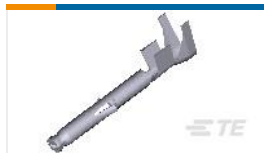
TE Part #770988-1 MINI UMNL SOK 22-18AWG SN LP