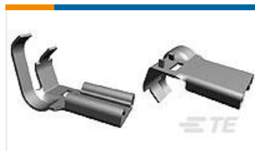
TE Part #42742-2 250 FASTON FLAG REC 18-12 AWG TPBR