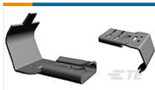
TE Part #61177-2 250 FASTON FLAG REC 18-12 AWG TPBR