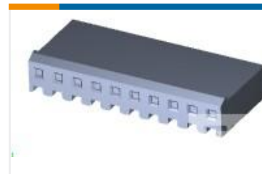
TE Part #1-640250-0 10P SL156 HSG W/LCK RAMP NATL