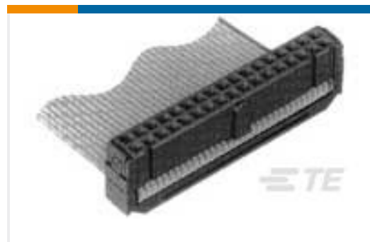
TE Part #1-1658622-0 50 NOVO MIL/CTR 30DP,LEAD FREE