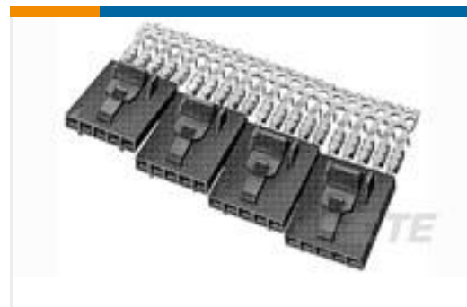
TE Part #5-103958-1 10X2 MTE RPT SR LATCH .100CL