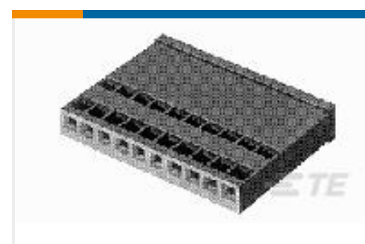
TE Part #1-926657-0 10P LOCKG