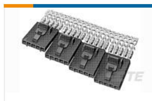
TE Part #5-103958-3 5X4 MTE RCPT SR LATCH .100CL