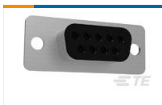
TE Part #205203-3 CRIMP SNAP RCPT ASSY, SIZE 1