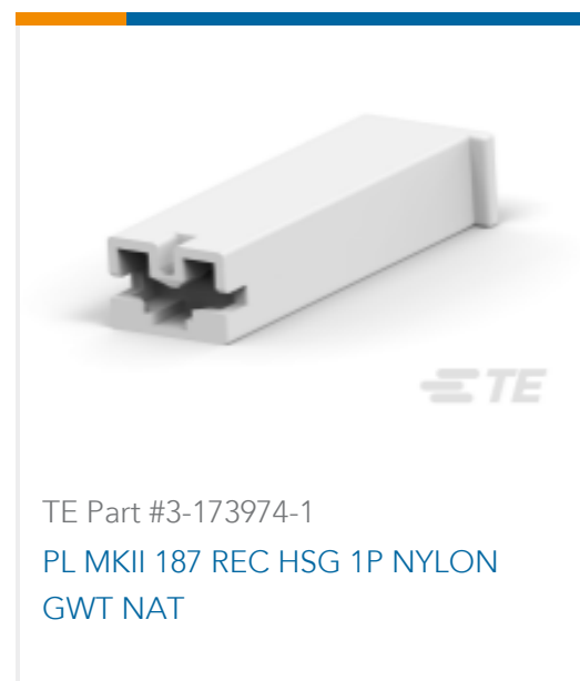
TE Part #3-173974-1 PL MKII 187 REC HSG 1P NYLON GWT NAT