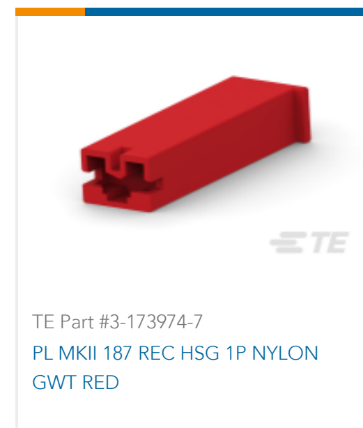
TE Part #3-173974-7 PL MKII 187 REC HSG 1P NYLON GWT RED