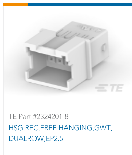
TE Part #2324201-8 HSG,REC,FREE HANGING,GWT, DUALROW,EP2.5