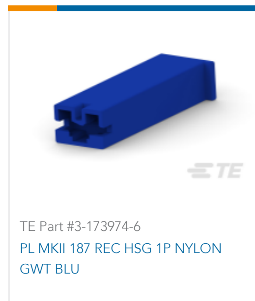
TE Part #3-173974-6 PL MKII 187 REC HSG 1P NYLON GWT BLU