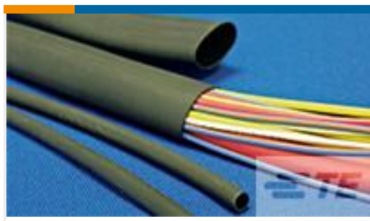
TE Part #1366094002 NETM1000-10-0-SP