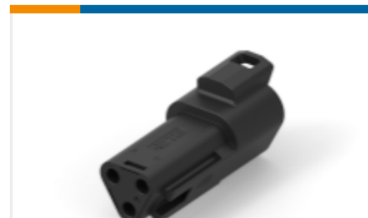
TE Part #2-2600026-1 3CCT BLACK RECEP W/SMALL SEAL