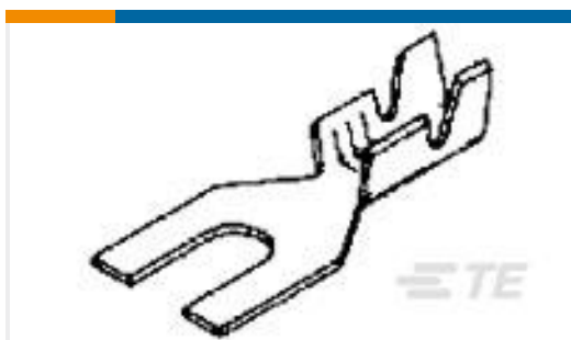
TE Part #60775-1 SPADE TERMINAL 18-14 AWG BR