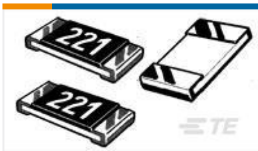
TE Part #2176230-2 3522 1R0 5% 3W