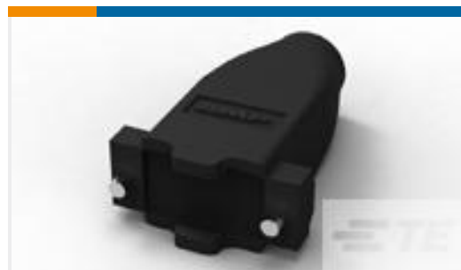
TE Part #5745854-3 CABLE CLAMP KIT,SZ 1