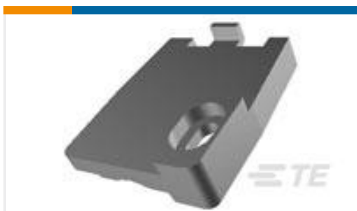
TE Part #1-640720-0 03P UMNL STR/REL & INSRT NATL