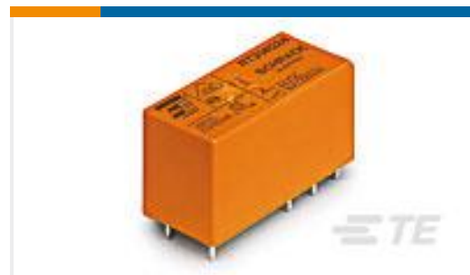
TE Part #5-1393243-6 RT424F24