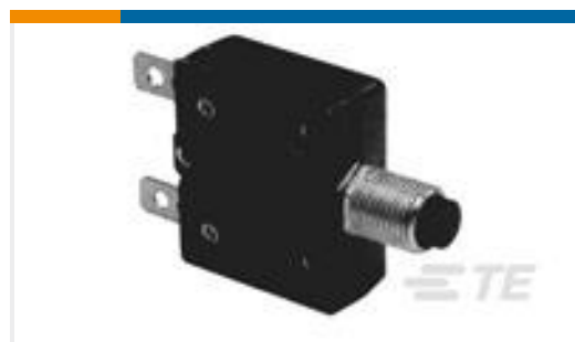
TE Part #1-1423674-0 W54-XB1A4A10-25=CKTBKR,THERM,P