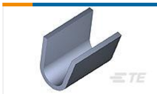
TE Part #61299-1 SPLICE 7000-12500 .031 TPST