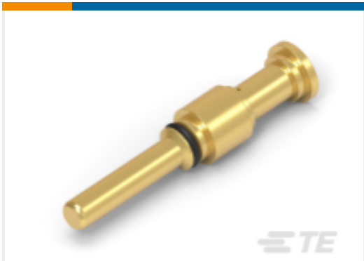
TE Part #61-0203-011-000 CONTACT PIN 3.6 MM