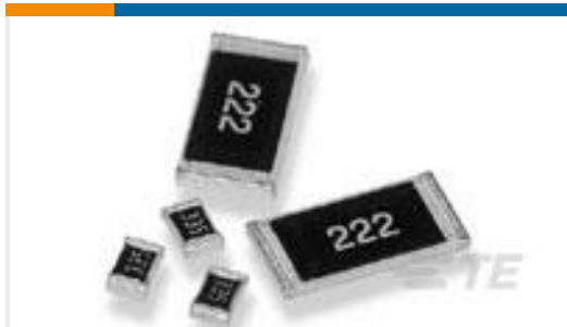
TE Part #2-1879502-8 CRGH2512 5% 180K 2W