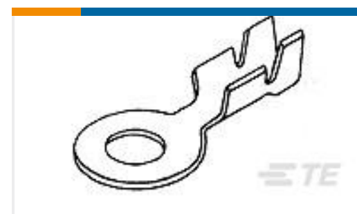
TE Part #40724 RING 164(4.17 MM) TERMINAL18-14 AWG TPBR