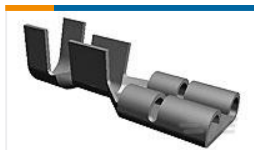
TE Part #63539-1 250 FASTON REC 14-10 AWG TPBR