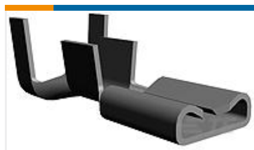
TE Part #60196-2 187 FASTON REC 20-16 AWG TPBR