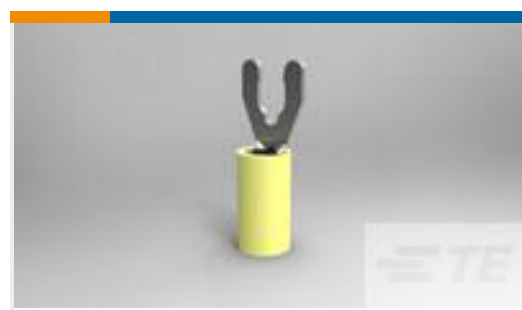
TE Part #52943-1 TERMINAL,PIDG SPR SPD 12-10 10