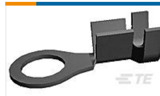
TE Part #640253-2 RING TONGUE .190 16-12 AWG TPBR