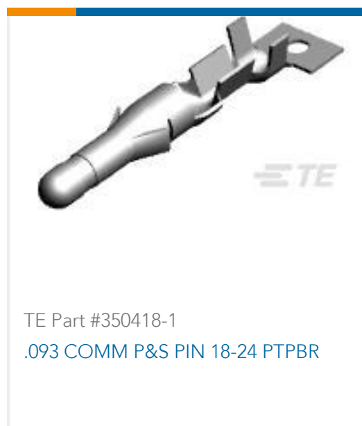
TE Part #350418-1 .093 COMM P&S PIN 18-24 PTPBR