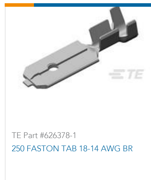
TE Part #626378-1 250 FASTON TAB 18-14 AWG BR