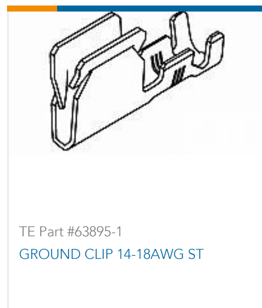
TE Part #63895-1 GROUND CLIP 14-18AWG ST