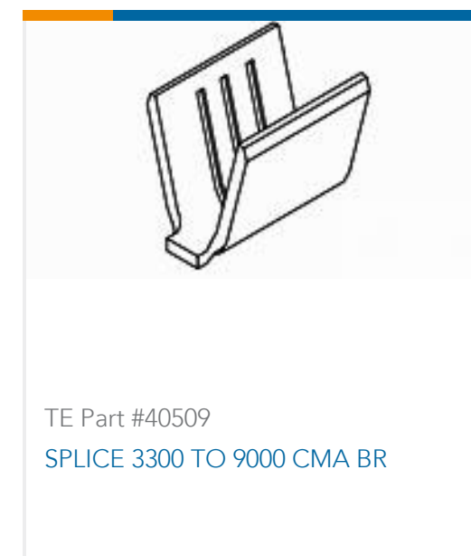
TE Part #40509 SPLICE 3300 TO 9000 CMA BR