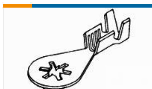
TE Part #61794-4 RING 18-14 AWG BR