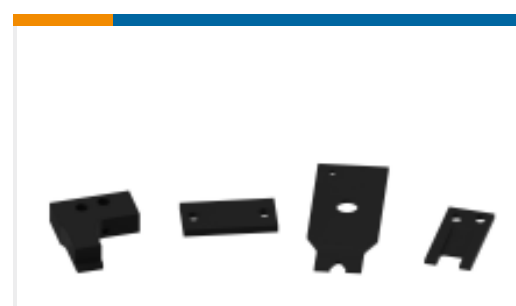
TE Part #240644-1 PLATE-REAR SHEAR