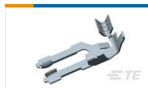
TE Part #926770-1 MT.EDGE CRIMP CONT.