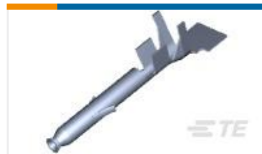
TE Part #770904-1 MINI UMNL SOK 22-18 AWG SN