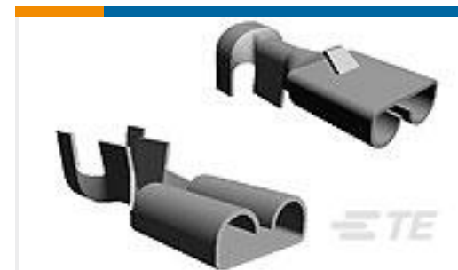
TE Part #160366-2 FF 110 SR. REC 22-20AWG TPBR