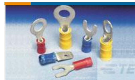
TE Part #322313 TERMINAL,PI FLAG R 16-14HD 14