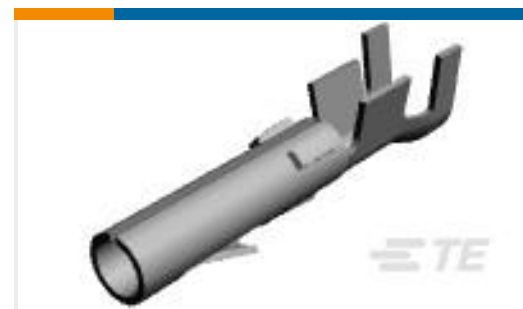
TE Part #60619-1 CMNL SOK PTPBR L/P