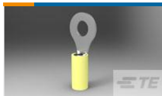
TE Part #35345 TERMINAL,PIDG R 12-10 1/4