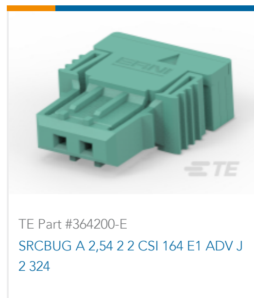
TE Part #364200-E SRCBUG A 2,54 2 2 CSI 164 E1 ADV J 2 324