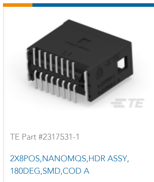
TE Part #2317531-1 2X8POS,NANOMQS,HDR ASSY, 180DEG,SMD,COD A