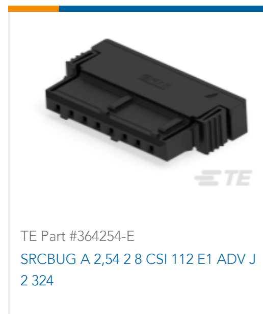
TE Part #364254-E SRCBUG A 2,54 2 8 CSI 112 E1 ADV J 2 324