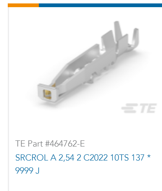
TE Part #464762-E SRCROL A 2,54 2 C2022 10TS 137 * 9999 J