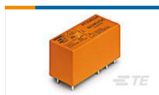
TE Part #5-1393243-4 RT424F12