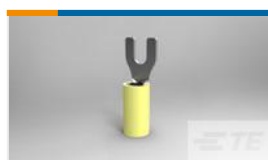
TE Part #8-35152-2 TERMINAL,PIDG SPD 12-10 8