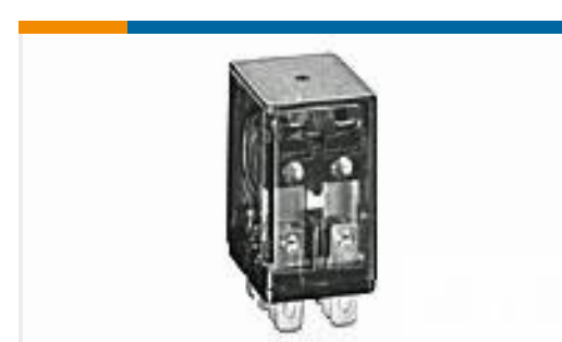
TE Part #5-1393144-0 K10P-11DT5-12=K10/K20