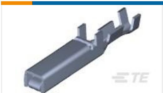
TE Part #1-175216-3 DYNAMIC D-3 REC CONT. S AU 0.76 L /P