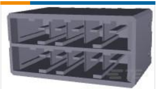
TE Part #1-917657-3 DYNAMIC D-3200M HDR ASSY 10P V /P