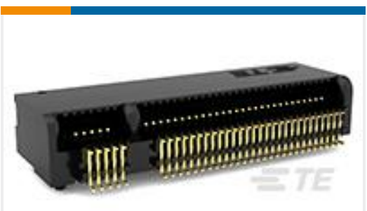
TE Part #2199230-2 M.2 0.5PITCH 4.2H KEY E GOLDFLASH