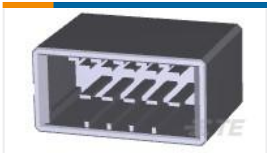
TE Part #178325-3 DYNAMIC D3100D HDR V 10P ASSY AU076