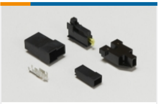
Magnet Wire Terminals(1)