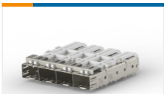
TE Part #1761008-3 SFP 1X4 CAGE & LIGHT PIPE KIT