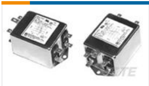
TE Part #6609066-2 6AYO1=F7692 S0