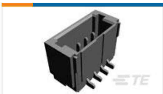
TE Part #1734595-5 1.0 WTB SR VT HDR 5 POS