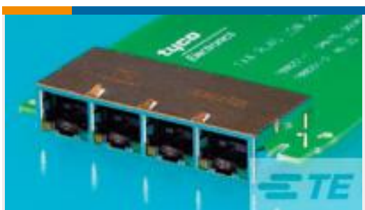
TE Part #1888251-2 Low Profile,RJ45,1x4,Bi-Color