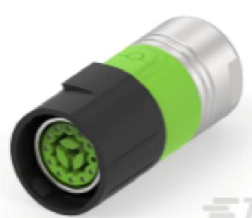
TE Part # ESA002F02340001000 615 PLUG