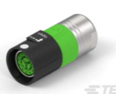
TE Part # ESA002N00310001000 615 PLUG