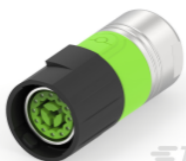
TE Part # ESA002F02320001000 615 PLUG