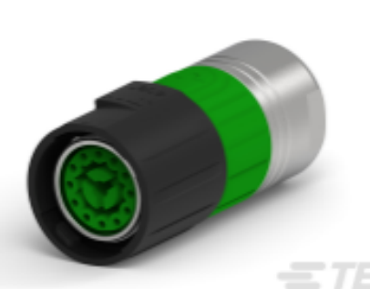
TE Part # ESA002N00320001000 615 EXTENSION