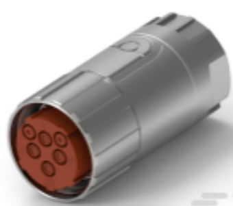
TE Part # CSA263F53450001000 940 PLUG