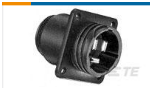
TE Part #206137-5 23-7 RECEPT STD SEX