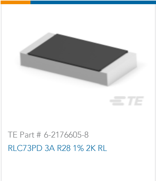
TE Part # 6-2176605-8 RLC73PD 3A R28 1% 2K RL